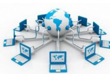
Active Data Network System