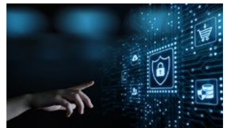
Network Security System