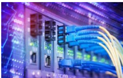
Passive Infrastructure System

Diverse set of technological tools and resources used to transmit, store, create, share, or exchange information. These technological tools and resources include computers, the Internet (websites, blogs, and emails), live broadcasting technologies (radio, television, and webcasting), recorded broadcasting technologies (podcasting, audio and video players and storage devices) and telephony (fixed or mobile, satellite, Visio / videoconferencing, etc.).